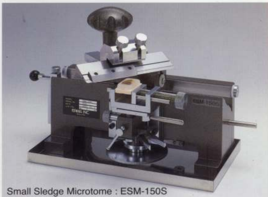
Small Sledge Microtome : ESM-150S

Range of graduations for cutting of specimen : 0.5~12 μm in increments of 0.5 μm